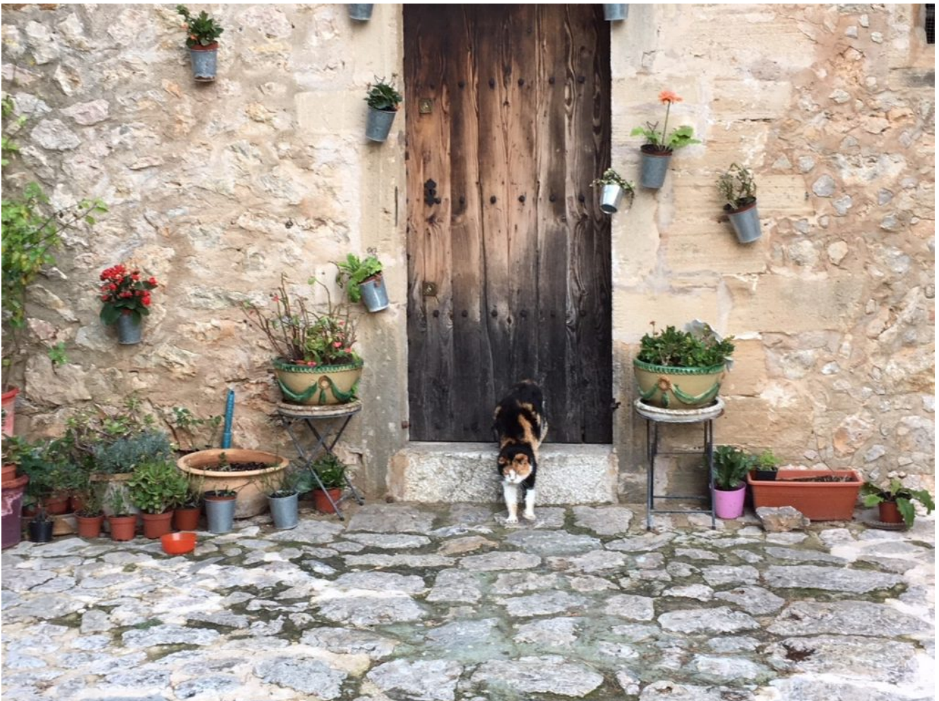
A cat along the 365 Calvary Steps in Pollenca, Mallorca

Along your journey, catch your breath and view the gorgeous homes and shops dotted along the steps. You will also find the occasional cat enjoying a siesta under the trees – a welcome sight to get your mind off the steep trek. Once you reach step number 365, enjoy gorgeous views of the Traumantana Mountains.