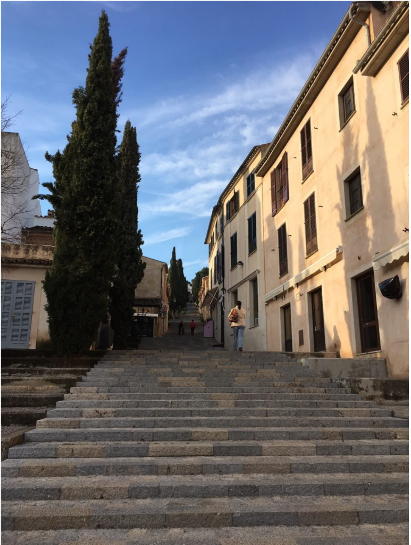
Up the 365 Calvary Steps, Pollençia, Mallorca

If you don't look hard enough, you could possibly miss an important attraction in old town Pollençia, the 365 Calvary