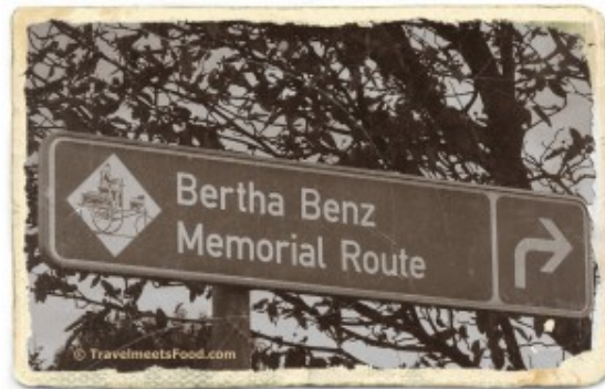
Bertha Benz Memorial Route

Did you know that the first long-distance trip in a car was successfully completed by a brave woman along a route dedicated to her known as the Bertha Benz Memorial Route ?