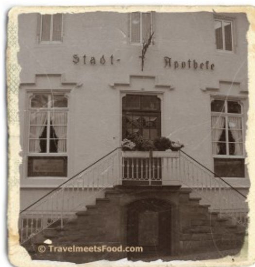
First filling station,

Along the route, today known as the Bertha Benz Memorial Route , Bertha encountered some problems. She ran out of fuel and had a minor breakdown on roads which existed mainly for farm animals.