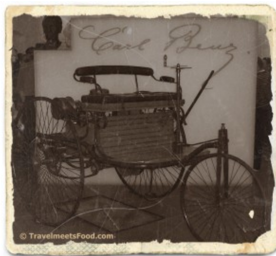
Replica of Carl Benz auto

With no navigation system to guide them or colorful dashboard sounds and symbols to warn of mechanical errors, the brave travelers along today's Bertha Benz Memorial Route listened for potential break-down sounds.